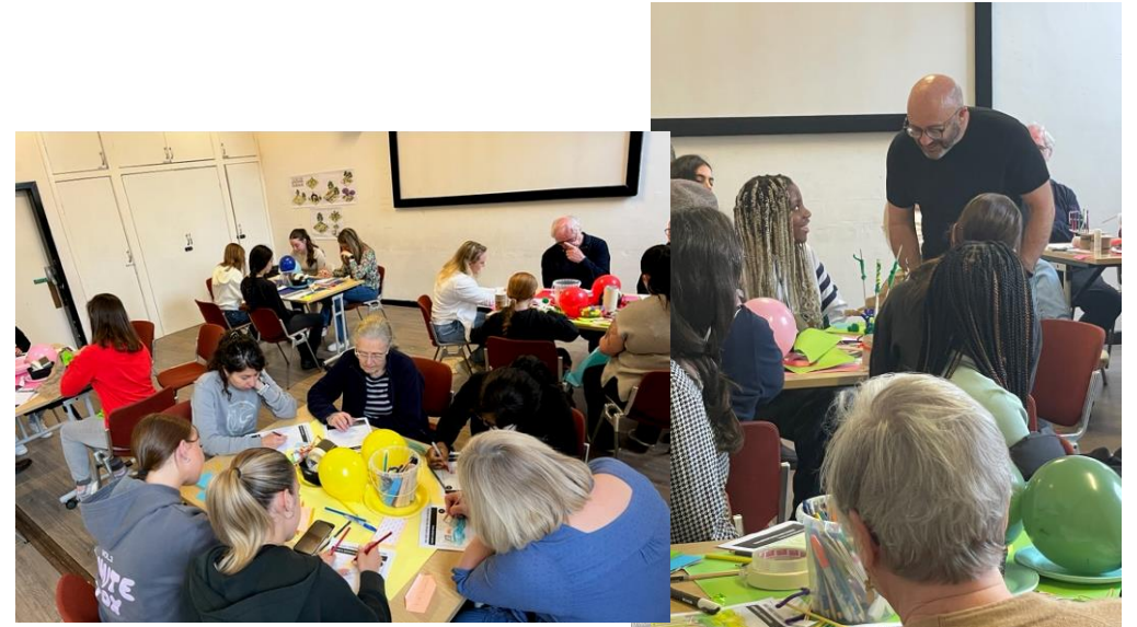
Women and Girls Intergenerational Workshop

There is an increasing evidence base that girls and young women are being designed out of city centres in general and parks in particular. In attempting to ensure the urban park is as inclusive as possible, ACC and the design team strongly believed that a female-led engagement session would help identify the key priorities for women and girls and thereby help create a more accessible and inclusive space for all. With the help of Creative Learning's Young Ambassadors and Aberdeen Youth Movement, a wide selection of women and girls of all ages came together, mostly from Aberdeen Arts Centre and Citymoves. Hugely valuable feedback around topics including safety, lighting, seating, accessibility, inclusivity, feel and 'vibe' was gathered through a range of creative activities.